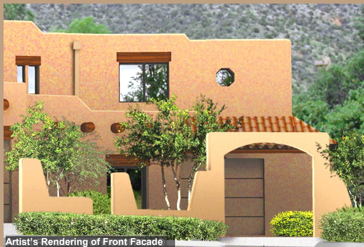
Artist's Rendering of Front Facade